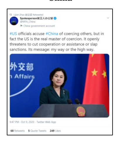
Figure 4. Hua Chunying's tweet hit back at the United States' accusations against China

China's mastery of propaganda is actually nothing new. Under the leadership of the Chinese Communist Party, there was