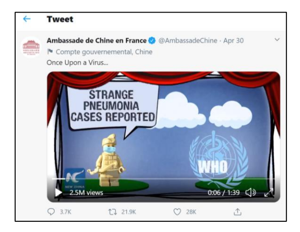
Figure 5. Tweet of the Chinese Embassy for France