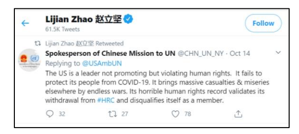
Figure 3. Tweets of Chinese diplomats at the United Nations attacking the US

Statements and attacks were publicly conveyed by Chinese diplomats not only via Twitter, but also in other formal forums. For example, in the relationship between China and Australia, China by using its trading instruments forced Australia to conduct independent investigations terms of research on the origins of COVID-19. Through the ban on commodities from Australia such as wine and beef. Australia's position looks weak. Next, of course, what continues is an open confrontation between China and the United States. Figure 5 shows how Chinese diplomats at the UN stated that the United States was a leader for human rights violators. The United States is considered to have failed to protect its population, resulting in massive losses and impacts on the country.