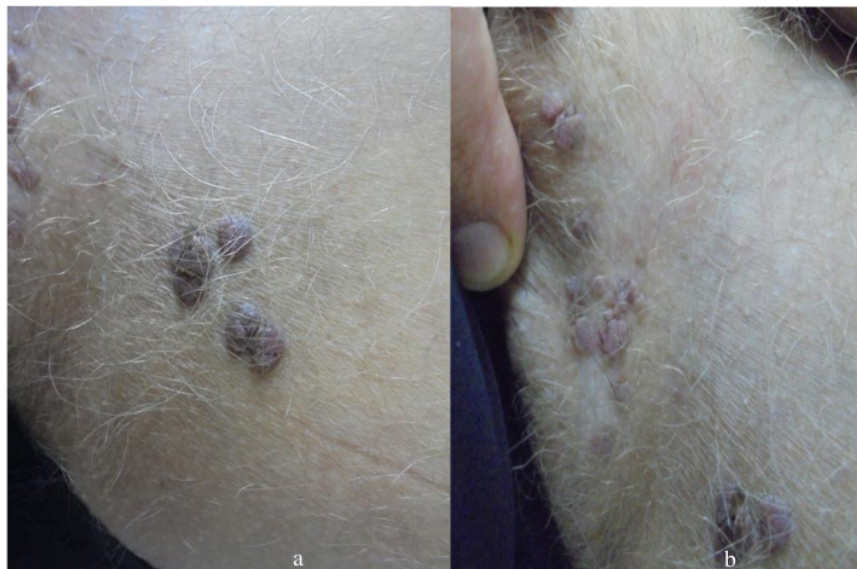
Figure 1a-b. multiple small, well-defined, grey-brown papules on the scrotum and left groin.

Based on the history, physical examination, and dermoscopy examination, we make a differential diagnosis of Bowenoid Papulosis, Squamous Cell Carcinoma, and Condyloma Acuminata. The patient is scheduled for an excisional biopsy one week later.