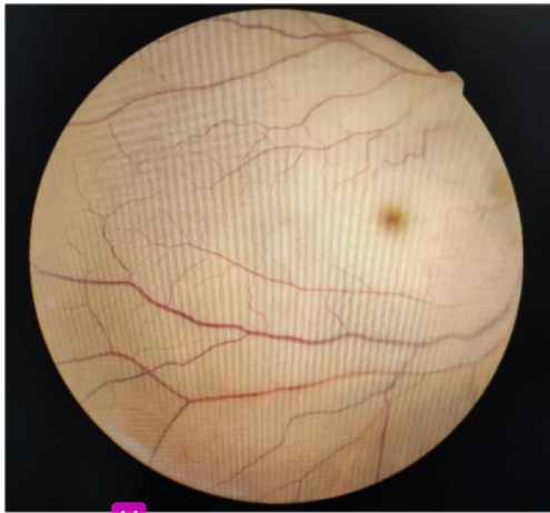
Figure 1. Right eye fundus examination with pale retina and cherry red spot appearance

This patient was a female of minahasa ethnicity, age 59. The patient came with a chief complaint of sudden right eye vision loss seven days ago. The patient didn't feel any pain due to this vision loss. This symptom came suddenly in the morning while the patient woke up. The patient had this symptom for the first time about one month ago, but the Symptoms were resolved suddenly in a few minutes. The patient thought that this second occurrence was the same as the initial. After four days without recovery, she went to the hospital for help. No recent medication or procedure was taken. The patient doesn't have any history of hypertension, valvular disease, hypercoagulability, hyperlipidemia, migraine, non-stroke cerebrovascular disease, diabetes, septicemia, systemic vasculitides, smoking, Transient ischemic attack, endarterectomy procedure, valvular disease, valvular septal procedure, heart, and arteriosclerotic disease.